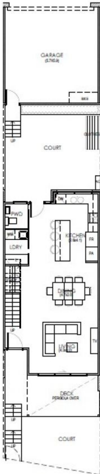
■ GROUND FLOOR