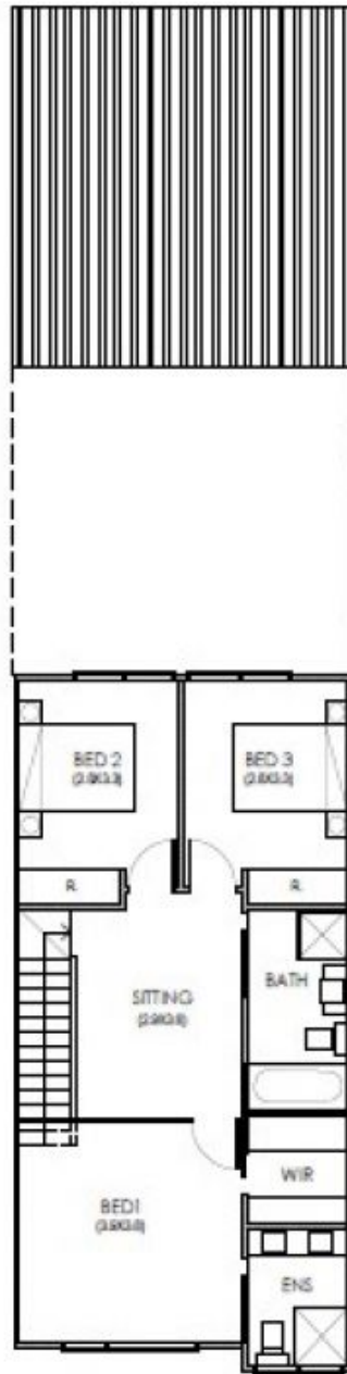
■ FIRST FLOOR